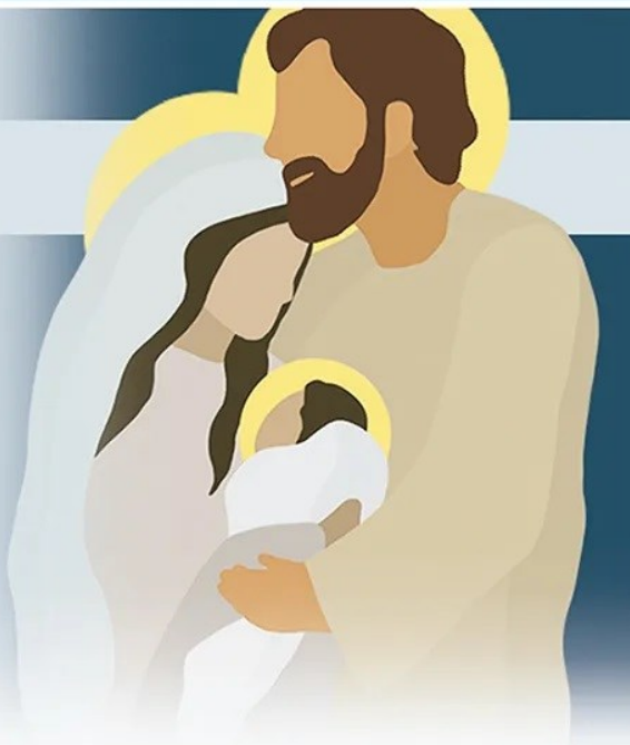
Copyright © 2021, United States Conference of Catholic Bishops, Washington, D.C. All rights reserved

Help us to faithfully commit ourselves to the service and defense of human life— especially where it is vulnerable or threatened. Obtain for us the grace to do the will of God in all things. Amen.