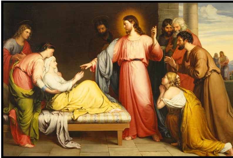
Jesus the Healer